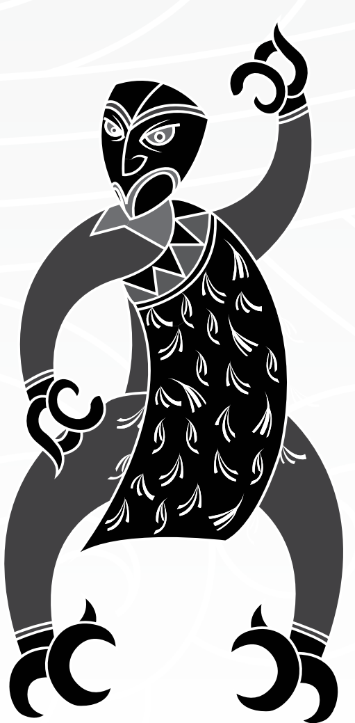
1832 Birth of Te Kooti at Te Pā o Kahu, Tūranaanui ā Kiwa