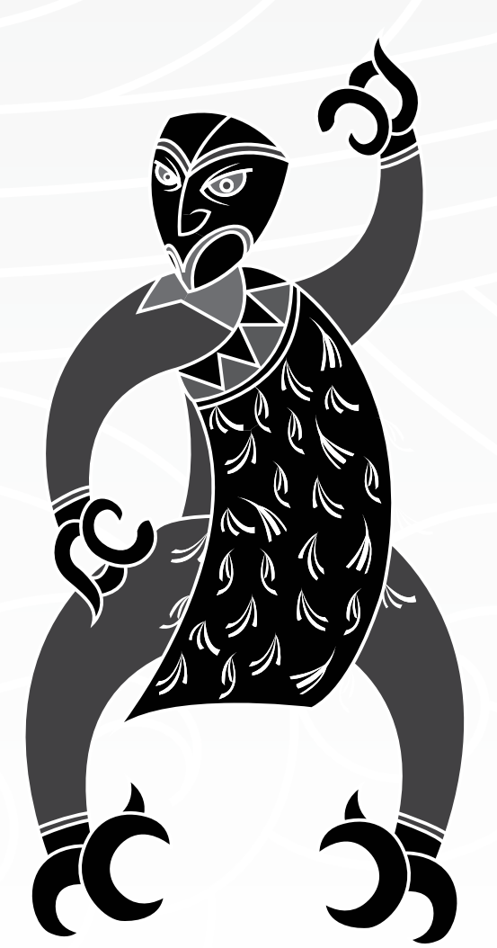
1832 Birth of Te Kooti at Te Pā o